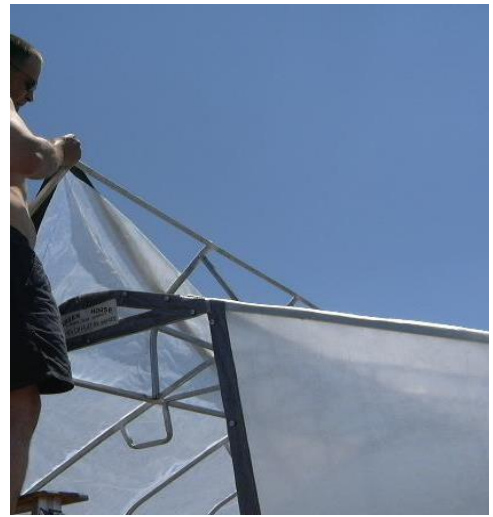
12. Re install the opening roof arches