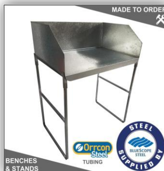
BENCHES & STANDS

Wheels adds $290 Wheelchair access option available