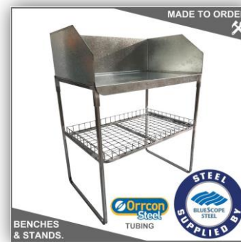
BENCHES & STANDS

The potting bench consists of a galvanised steel work tray with 3 raised side and galvanised steel frame and legs. Rounded edges for OH&S. All components slot together for easy assembly - no tools required. The lower shelf is made from 50 x 50mm steel mesh - useful for storage.