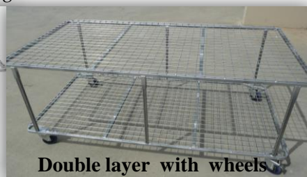
Double layer with wheels