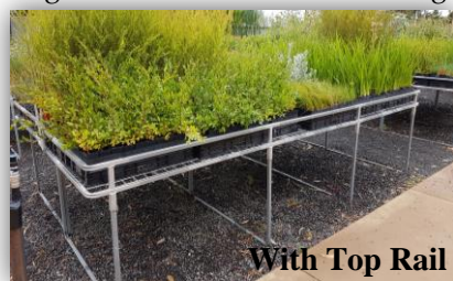
With Top Rail

Height - 690mm. Lower shelf height - 150mm. Wheels adds 135mm to height.