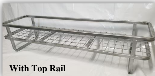
With Top Rail