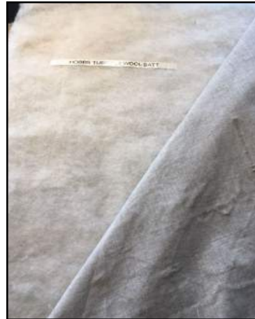
3. The Batting.