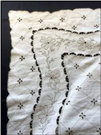
1. The Linen.

A wholecloth linen quilt consists of four layers: