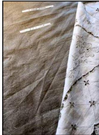
2. The Underlayment