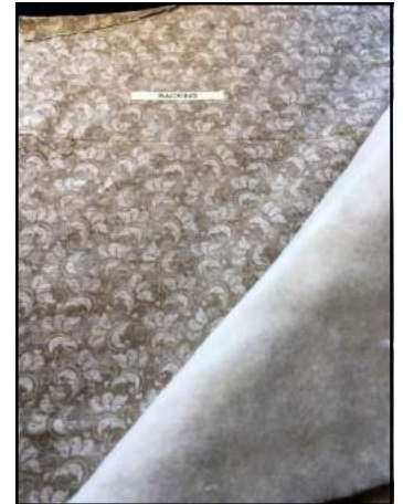
4. The Backing.

All four layers are basted together just like you would a regular pieced quilt top.