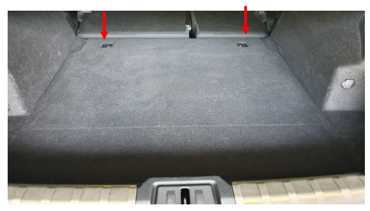
Step 4) Remove the necessary screws to be able to remove the rail.