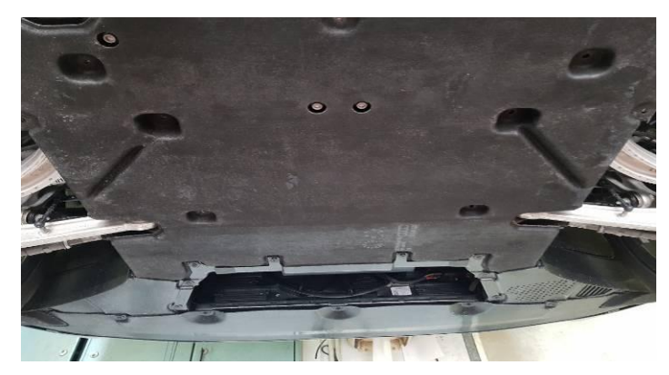
Step 1) Start with the installation on the front axle.

The SLAVE device must be installed here.