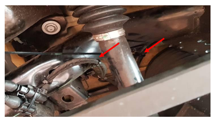
Step 1) In the last step, the Can-Bus line must be laid inside.

It is very important that you move along the original cables as much as possible so that the cable does not come under tension or tear.