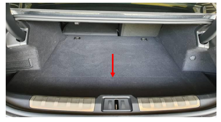
Step 3) Open the trunk and remove the bottom cover.