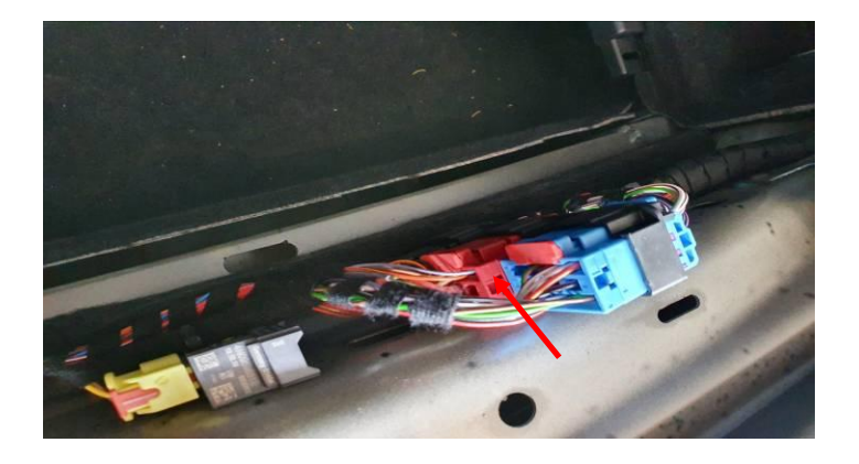
Step 7) - CAN-BUS

Locate the CAN-BUS on the red connector.