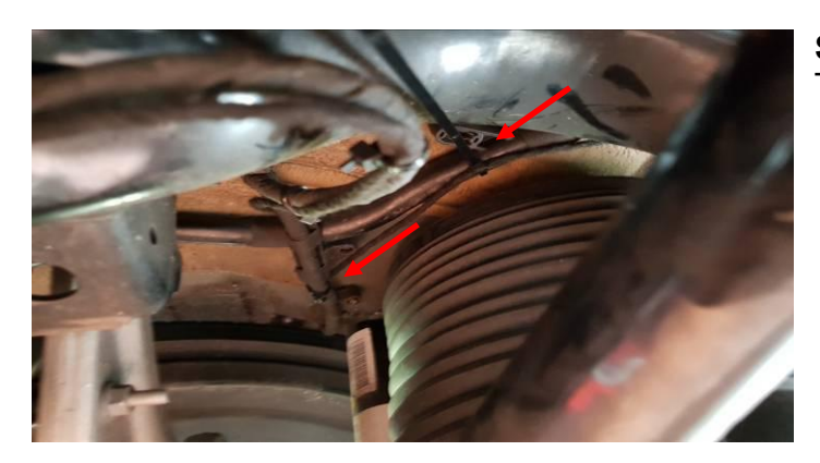
Step 2) The Can-Bus must be laid in the "center".

It is very important that you move along the original cables as much as possible so that the cable does not come under tension or tear.