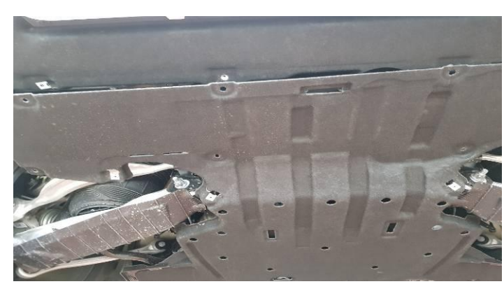
Step 2) Locate the sensors, recognizable by the black housing.

Open the clips of the cladding so that you can remove it or tilt it to install the electronics.