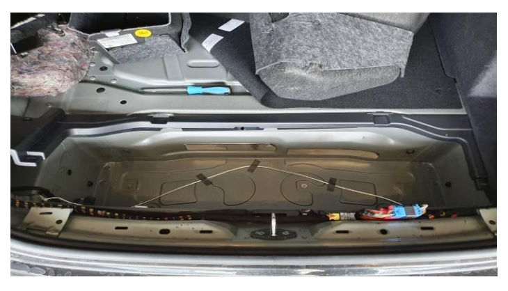
Step 6) In order to get the can line inside, the grommets in the trunk floor could be used, for example.