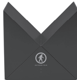
Adjustable Wireless Speaker