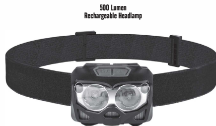
Rechargeable Battery 1200 mAh