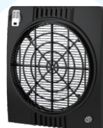
Return Duct Kit