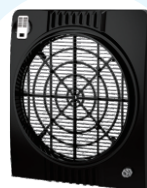
Optional Return Duct Kit