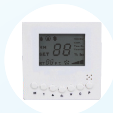
Optional Remote Control