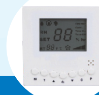
Optional Remote Control