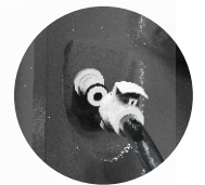
Quick draining connection