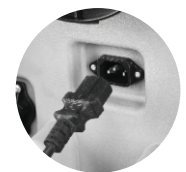
Quick power cord connection