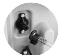
Quick draining connection