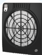
Optional Return Duct Kit