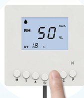
Optional Remote Control