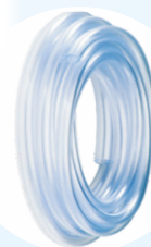
Wrinkle free tube