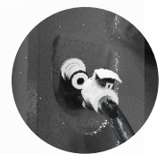
Quick draining connection