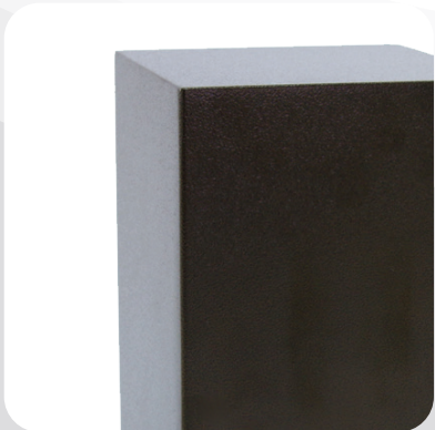
550 Antique Bronze