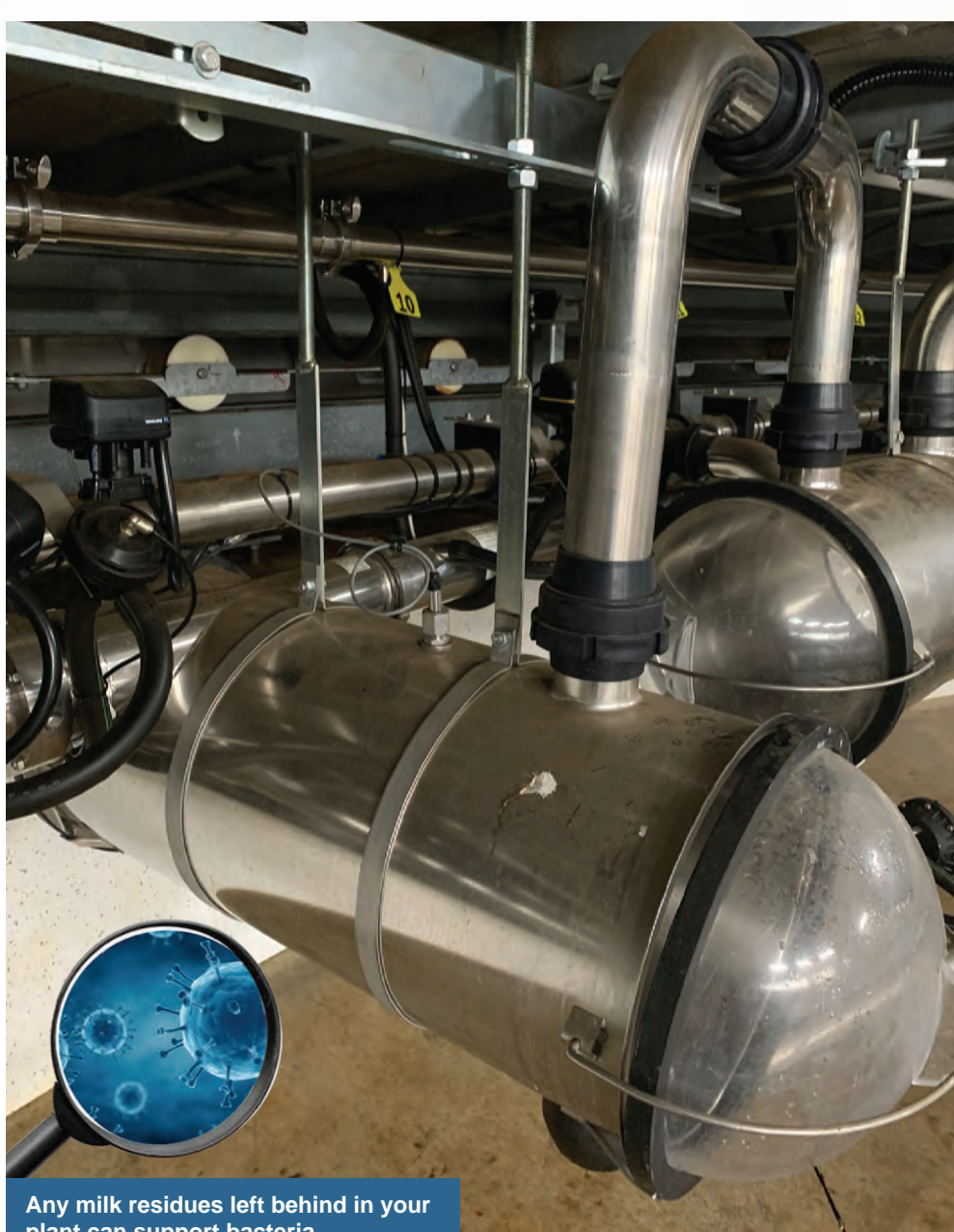
plant can support bacteria.

So, the moral of the story is you are in charge of your own destiny, you