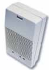
1825 Duet Plus®