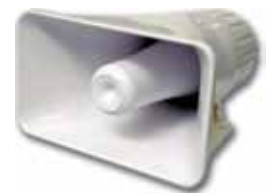
Algo's Optional 1185 Horn Speaker