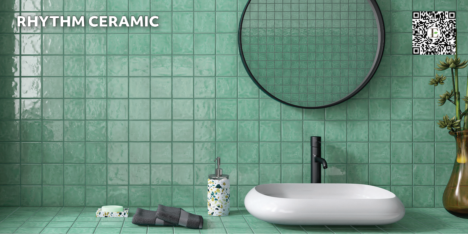
Featured Product: Emerald Green 4" x 4" Glossy