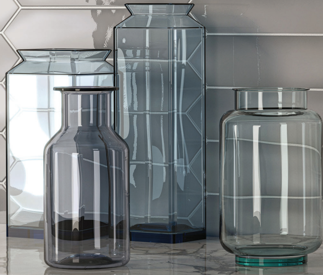
Featured Product: Optics Grey 2.6" x 13" Picket Glossy