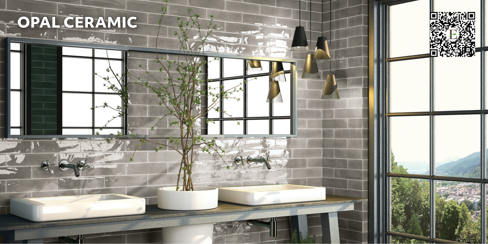
Featured Product: Opal Grey 3" x 12" Glossy