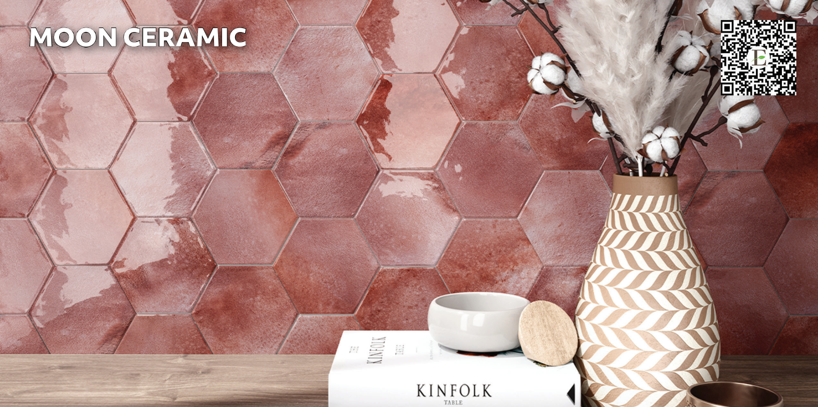
Featured Product: Moon Garnet Hexagon Glossy