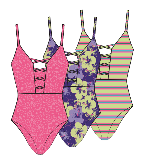
Bliss One Piece | D1786 | $37/$78 Available in XS-3X - Moderate Coverage

Colors: Flower Power - Recycled Micro Nylon, Hibiscus Punch - Recycled Micro Nylon, Y2K Stripe - Poly Rib