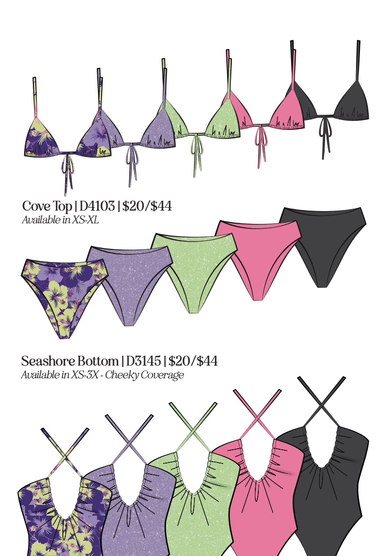
Lindsay One Piece | D3145 | $20/$44 Available in XS-3X - Moderate Coverage

Colors: Hibiscus Punch - Recycled Micro Nylon, Bedazzled Lilac, Cyber Lime, Plastic Pink - Recycled Micro Nylon, Black - Reycled Micro Nylon