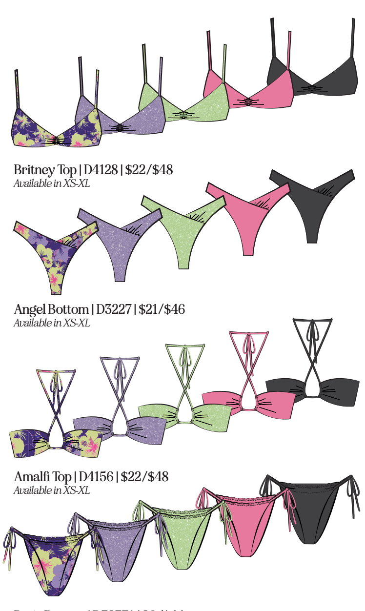
Paris Bottom | D3237 | $20/$44 Available in XS-XL

Colors: Hibiscus Punch - Recycled Micro Nylon, Bedazzled Lilac, Cyber Lime, Plastic Pink - Recycled Micro Nylon, Black - Reycled Micro Nylon