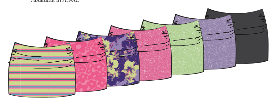
Lucky Swim Skirt | D8096 | $20/$44 Available in XS-3X

Colors: Y2K Stripe - Chiffon, Candy Sparkle, Cyber Lime, Bedazzled Lilac Flower Power, Hibiscus Punch, Black - Recycled Micro Nylon