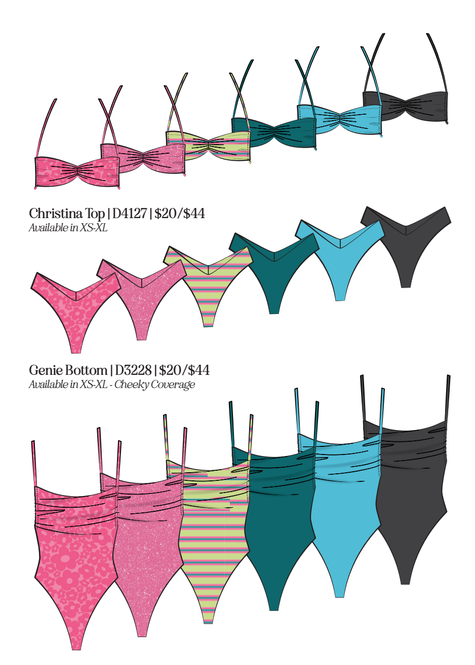
Gwen One Piece | D1921 | $35/$74 Available in XS-XL - Cheeky Coverage

Colors: Flower Power - Recycled Micro Nylon, Candy Sparkle, Y2K Stripe - Poly Rib, Envy - Recycled Micro Nylon, Blue Crush - Recycled Micro Nylon, Black - Recycled Micro Nylon