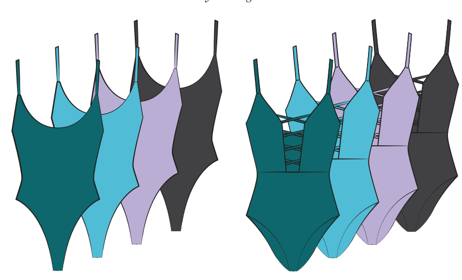
Star One Piece | D1920 | $34/$72 Available in XS-3X - Cheeky Coverage