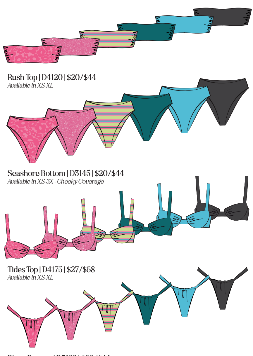
Bisou Bottom | D3192 | $20/$44 Available in XS-XL - Cheeky Coverage

Colors: Flower Power - Recycled Micro Nylon, Candy Sparkle, Y2K Stripe - Poly Rib, Envy - Recycled Micro Nylon, Blue Crush - Recycled Micro Nylon, Black - Recycled Micro Nylon