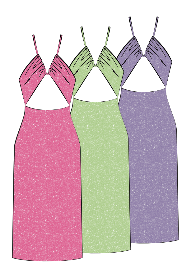
That's Hot Dress | D5132 | $28/$60 Available in XS-XL