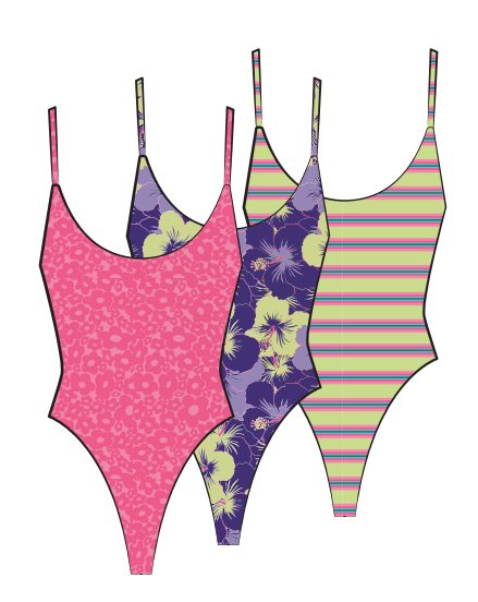
Star One Piece | D1920 | $34/$72 Available in XS-3X - Cheeky Coverage