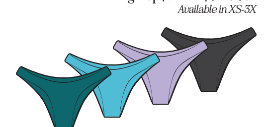
Nocturnal Bottom | D3032 | $20/$44 Available in XS-3X - Cheeky Coverage