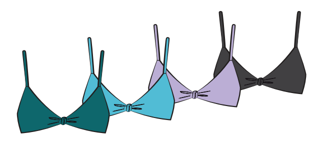
Zen Top | D4068 | $22/$48 Available in XS-XL