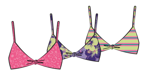
Zen Top | D4068 | $22/$48 Available in XS-XL