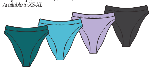
Ultra Bottom | D3034 | $20/$44 Available in XS-XL - Cheeky Coverage