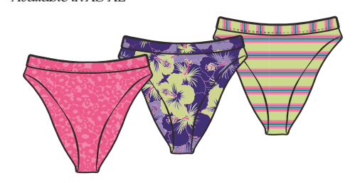
Ultra Bottom | D3034 | $20/$44 Available in XS-XL - Cheeky Coverage