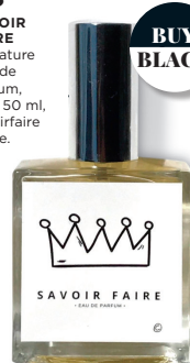
18 SAVOIR FAIRE Signature Eau de Parfum, $95, 50 ml, savoirfaire store.