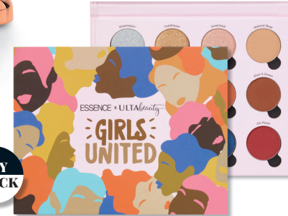
22 ESSENCE X ULTA BEAUTY Girls United Collection Eyeshadow Palette, $20, ulta.com.