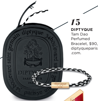
15 DIPTYQUE Tam Dao Perfumed Bracelet, $90, diptyqueparis .com.