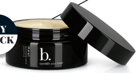
21 BENEATH YOUR MASK Heal Whipped Skin Soufflé, $80, neimanmarcus.com.