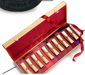
17 ESTÉE LAUDER Jackpot Pure Color Desire Lipstick Set, $125, nordstrom.com.