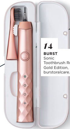
14 BURST Sonic Toothbrush Rose Gold Edition, $100, burstoralcare.com.