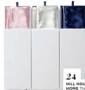
24 HILL HOUSE HOME The Sisi Silk Pillowcase, $85 each, hill househome.com.