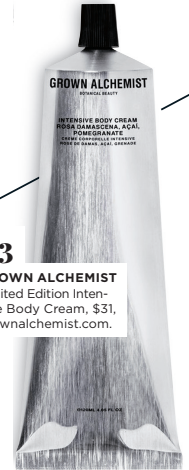
23 GROWN ALCHEMIST Limited Edition Intensive Body Cream, $31, grownalchemist.com.