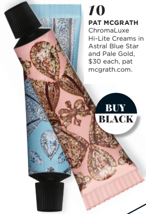
10 PAT MCGRATH ChromaLuxe Hi-Lite Creams in Astral Blue Star and Pale Gold, $30 each, pat mcgrath.com.