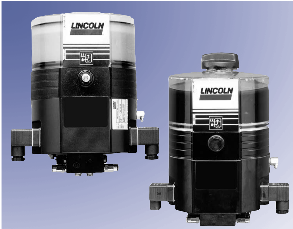
QLS301, QLS311 with Remote Control