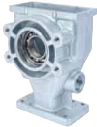
FlowMaster II crankcase