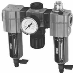
Model 85387-8 Included in 84144 Kit