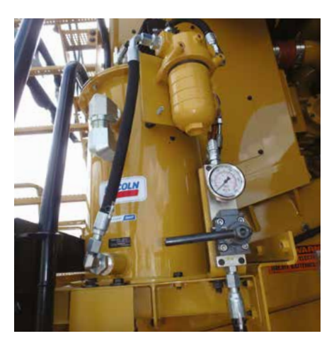
The mechanically operated, easy-to-install overflow prevention system is compatible with any pump using a Lincoln FlowMaster reservoir.