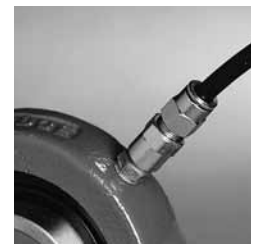
5. And plug the tube into the Quicklinc adapter