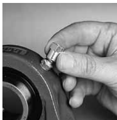
2. Place a Zerk-Lock onto the fitting