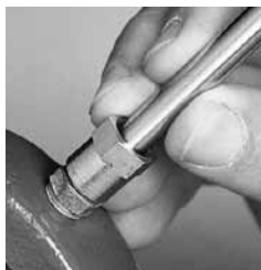
3. Seal and tighten Zerk-Lock using a hammer and staking tool