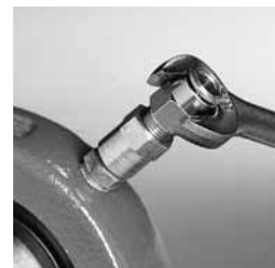
4. Then thread a Quicklinc completely into the Zerk-Lock