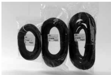
Convoluted Loom/Split Wrap