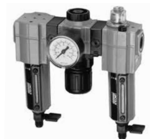
Filter-regulator with gauge-lubricator