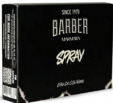
Size: 50 ml / 1,69 fl. oz. SPRAY BOX