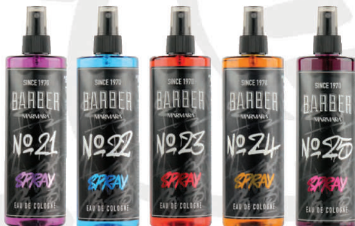
Size: 400 ml / 13,5 fl. oz. SPRAY