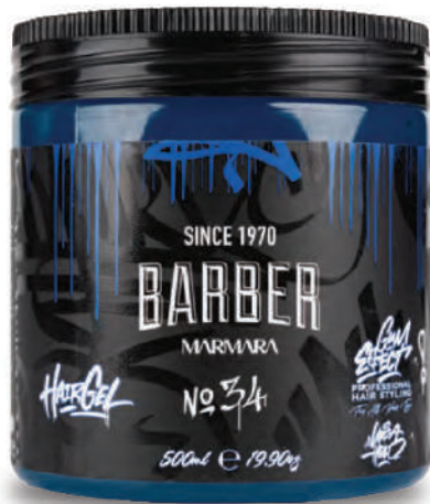
Size: 500 ml / 19,90 fl. oz.