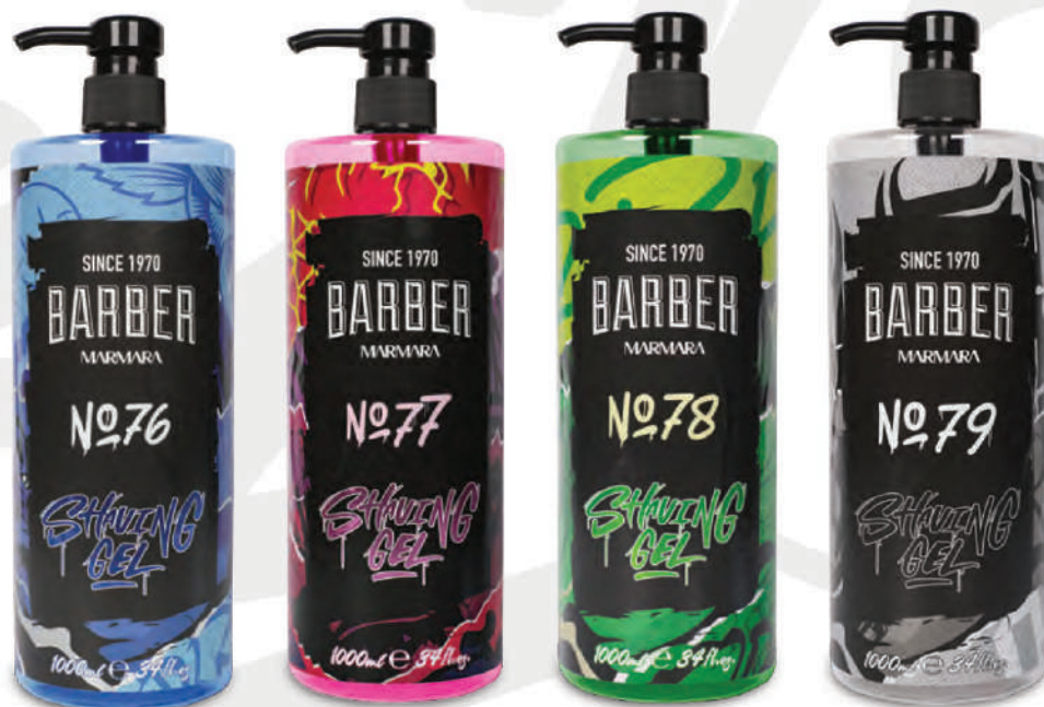
Size: 1000 ml / 33,8 fl. oz.