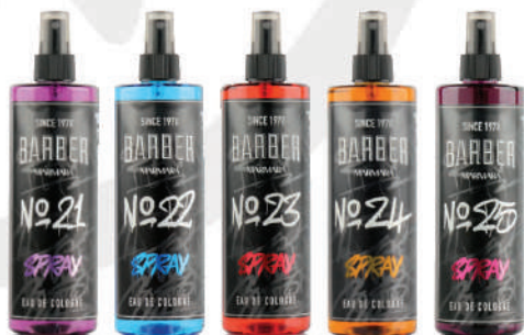
Size: 50 ml / 1,69 fl. oz. SPRAY