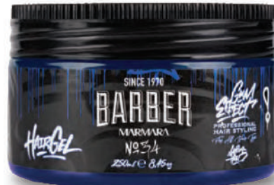
Size: 250 ml / 8,45 fl. oz.