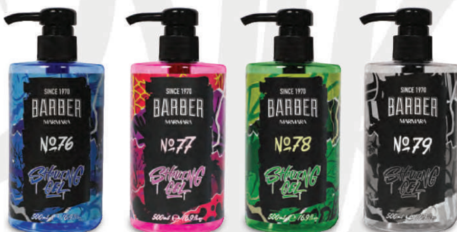
Size: 500 ml / 16,9 fl. oz.