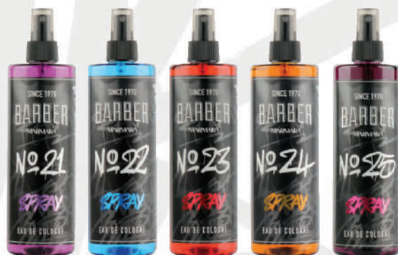
Size: 150 ml / 5,07 fl. oz. SPRAY