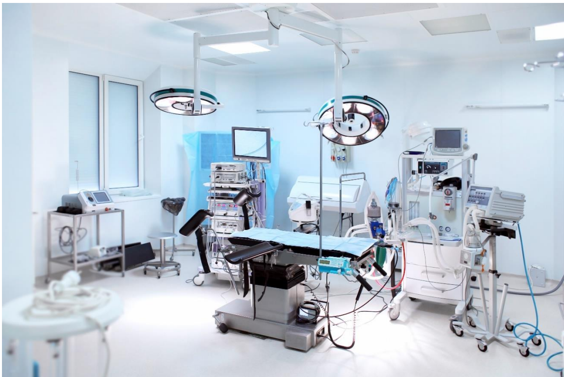
A modern operating theatre

The presence of microbial contamination in the air of operating theatres is known to have significant impact on the control of healthcare associated infections, and regular microbial monitoring can assess environmental quality and identify critical situations which require corrective intervention 1 . Typically, this is done by collecting air samples using settle plates or impactors. Both techniques require subsequent incubation of samples as well as lab testing and analysis.