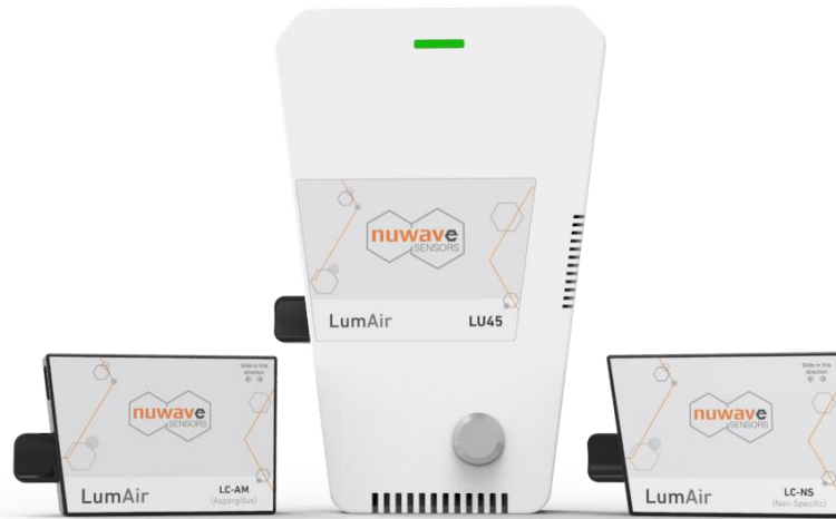
LU45 sensor and cartridges