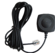
RLC-360 GPS Module

Includes Laser Module, Windshield Bracket and User Guide