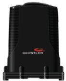
SWRA-37 Rear Antenna