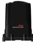
Maximum Performance Antenna w/ Laser