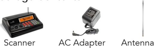
Scanner AC Adapter Antenna See the User Guide for complete instructions