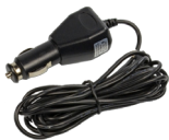
12V CAR ADAPTER