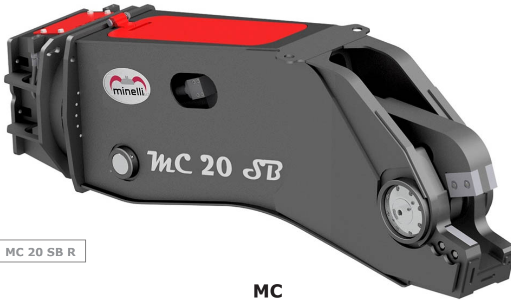
MC 20 SB R