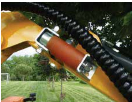
RELEASE SAFETY DEVICE