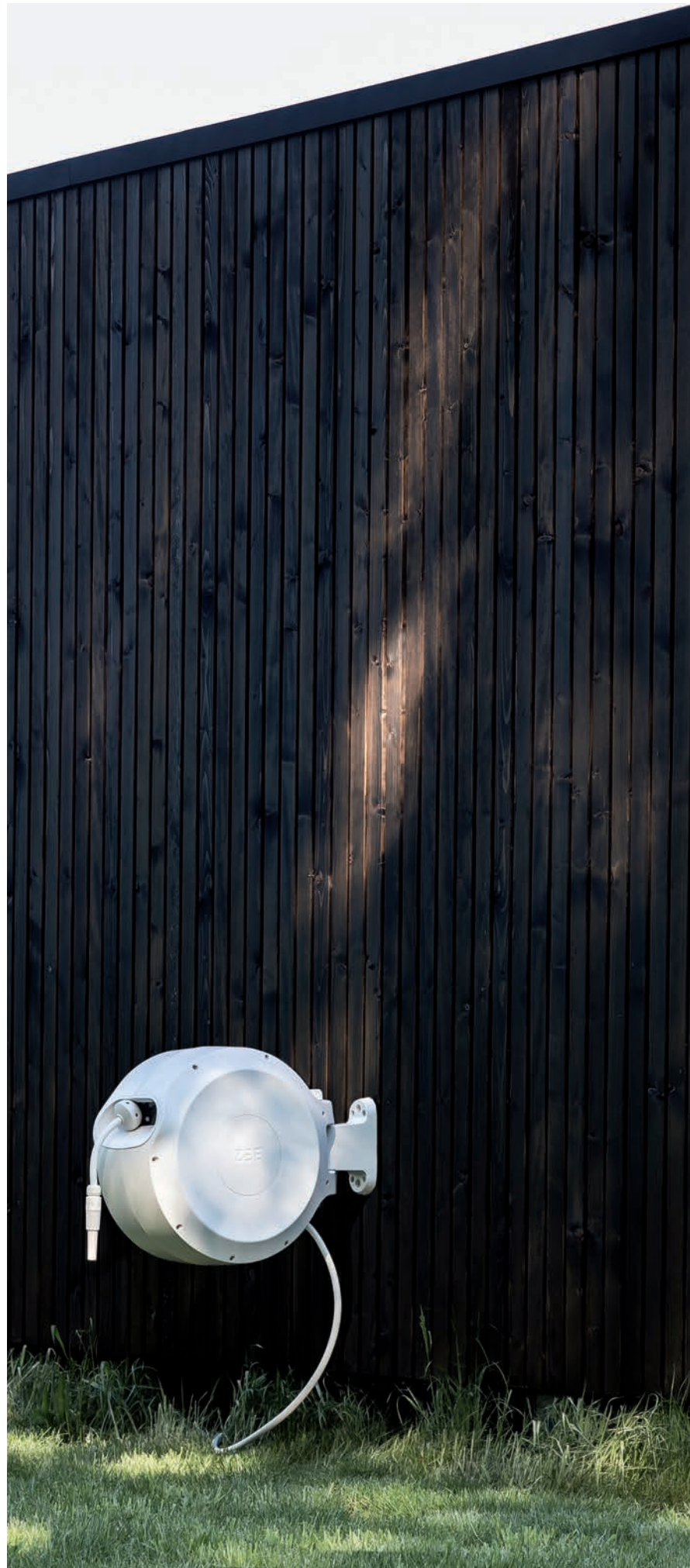
MIRTOON GARDEN HOSE