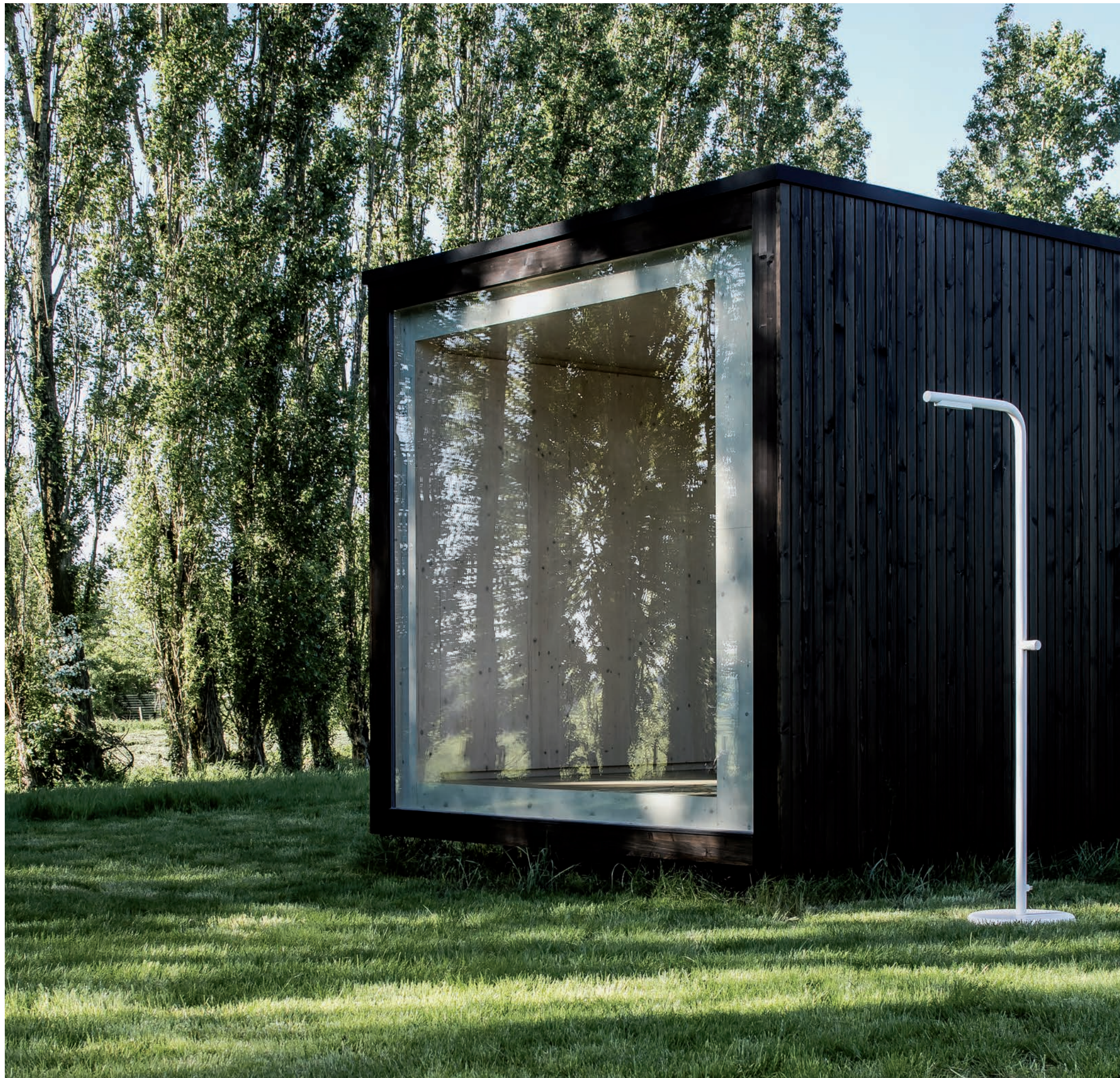
LEVANTINE OUTDOOR SHOWER