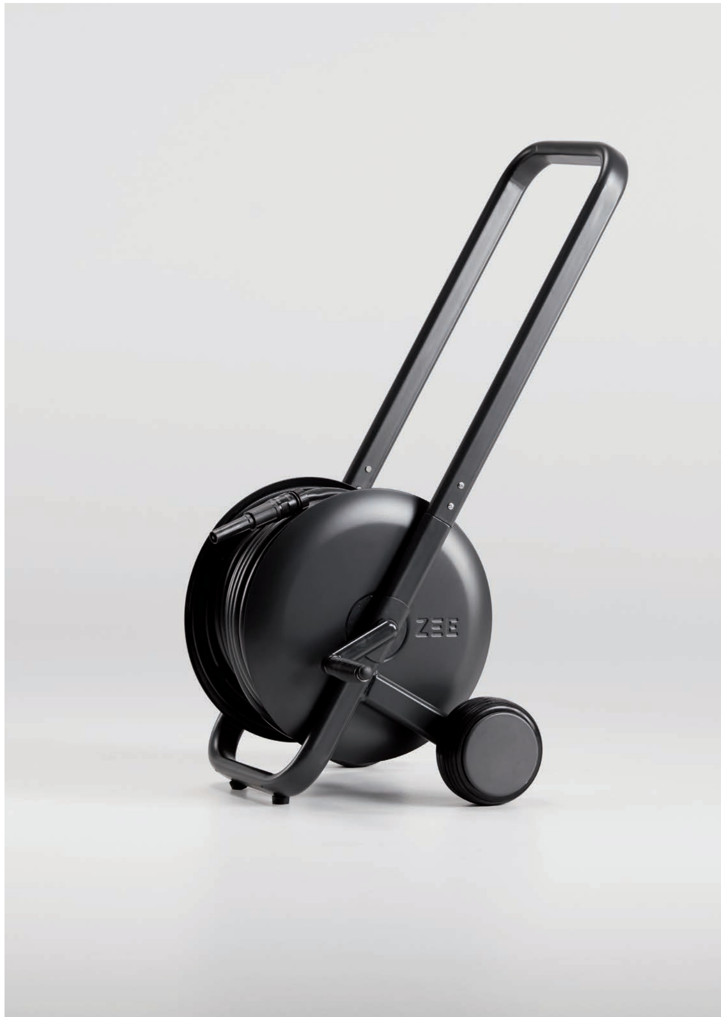
TASMAN HOSE TROLLEY