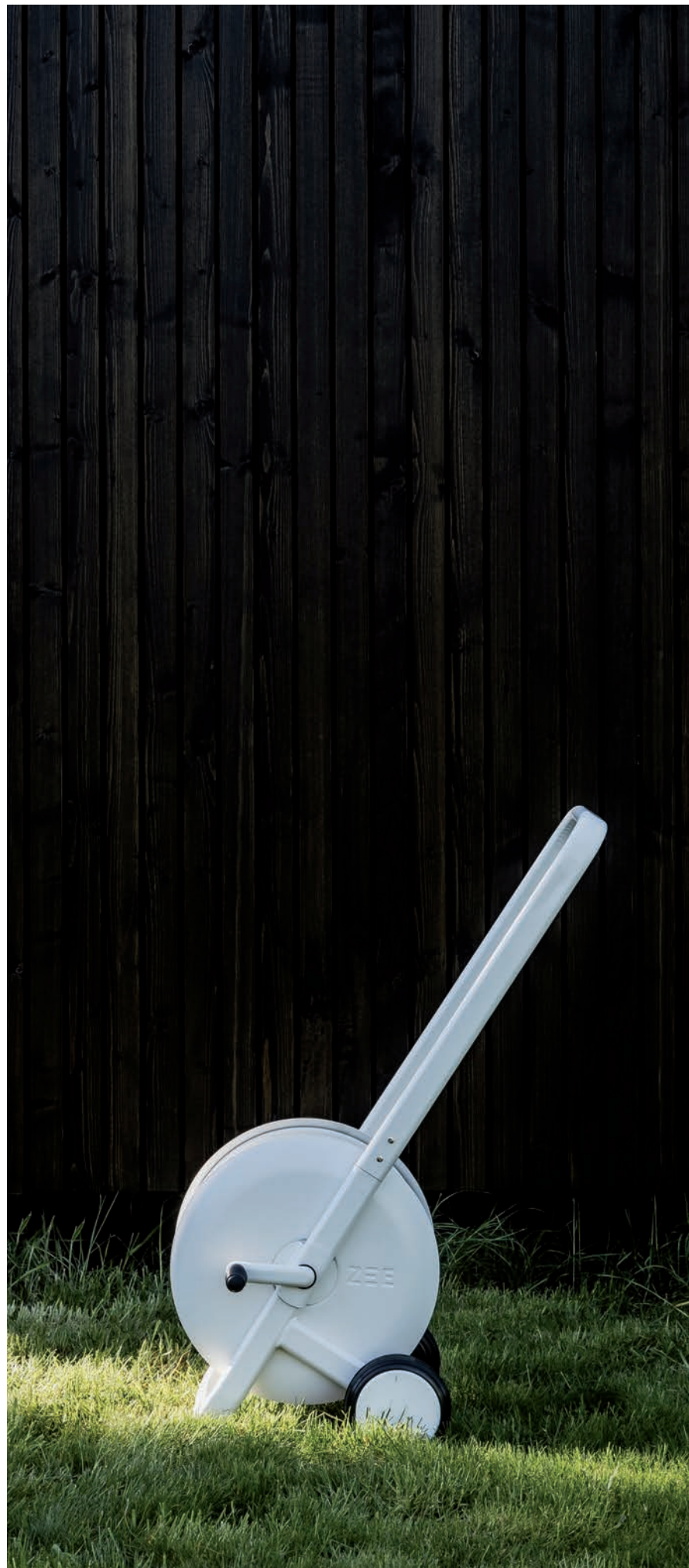
TASMAN HOSE TROLLEY