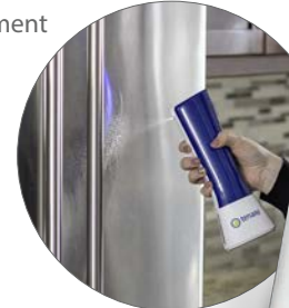
iClean mini Item #LQFC220