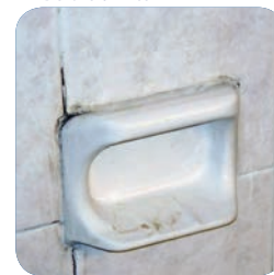
Before & After