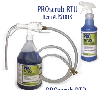
PROscrub RTU Item #LPS101K