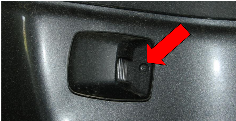
Figure 1 – License plate light removal

A. Remove the license plate lights by removing the small Phillips screws and pulling the housings from the bumper. You will have to disconnect the harnesses from each.