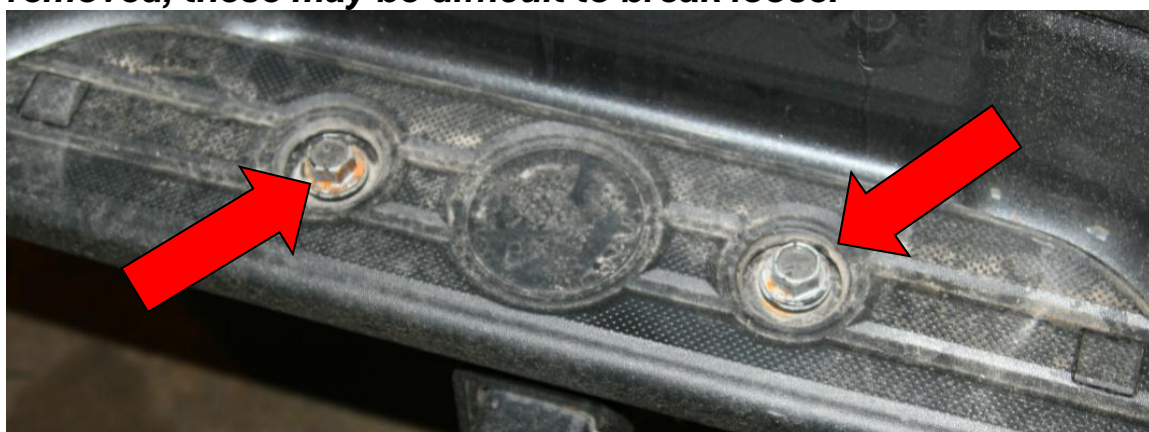
Figure 3 – Trailer hitch bolt removal

C. Using 19mm or 3/4" sockets and wrenches, remove the two vertical bolts holding the OEM bumper the trailer hitch bar. If this is the first time that the bumper has been removed, these may be difficult to break loose.