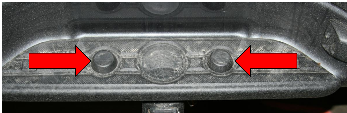
Figure 2 – Bolt cover removal

C. Using 19mm or 3/4" sockets and wrenches, remove the two vertical bolts holding the OEM bumper the trailer hitch bar. If this is the first time that the bumper has been removed, these may be difficult to break loose.