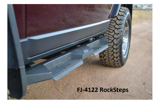
Other Body Armor products for the FJ Cruiser