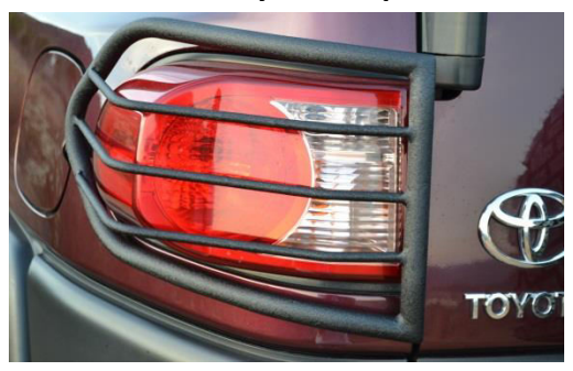
FJ-7135 Taillight guards