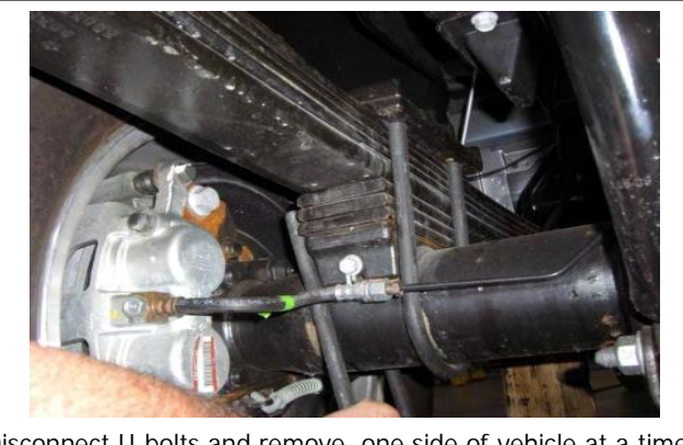
Disconnect U-bolts and remove, one side of vehicle at a time.