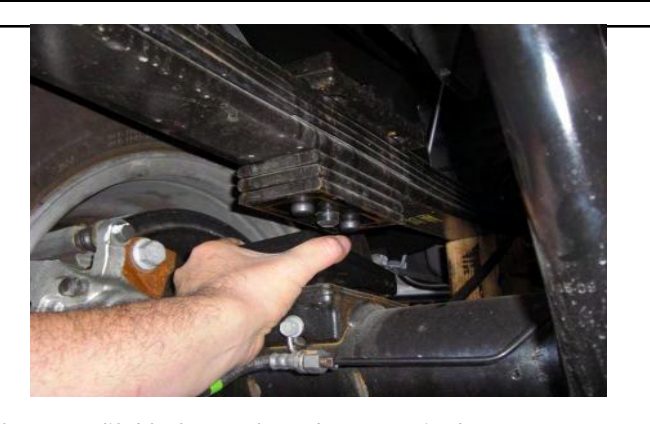
Place new lift block on axle pad, center pin down.