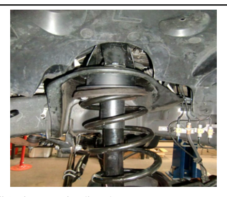
Re install Isolator and coil spring