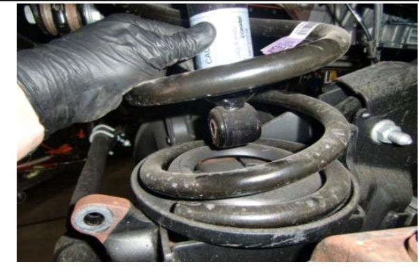
Slowly lower axle to remove tension on coil spring.