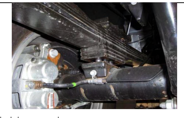
Slowly lower rear axle.