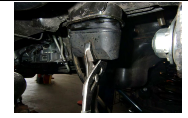
Remove Stock Bump Stop.