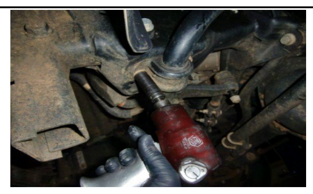
Disconnect sway bar from frame.