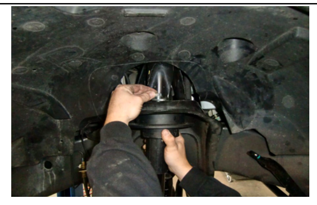
Attach ReadyLIFT Coil Spacer with supplied nuts "Leave Loose"