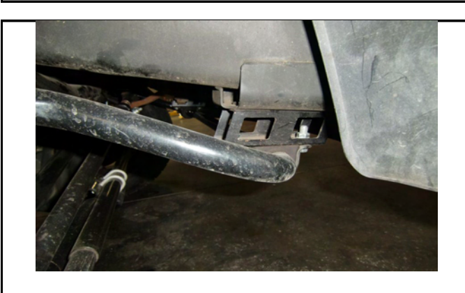
Install Sway bar drops. "off setting bar to the rear of vehicle"