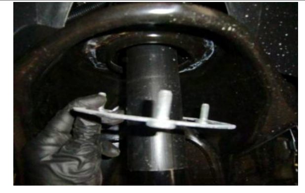
Remove factory retainer plate & nuts.