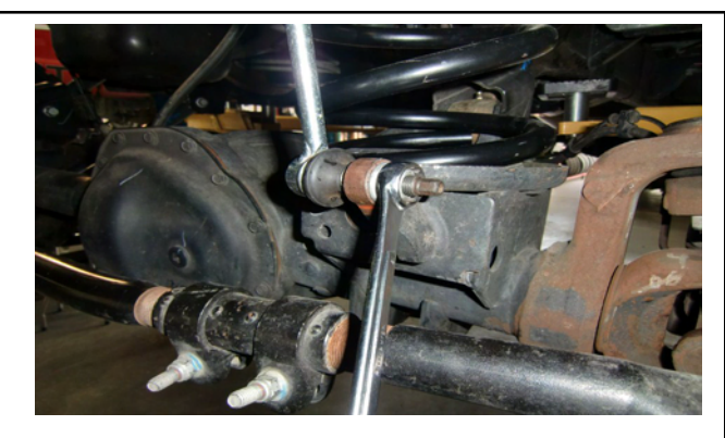
Re attach sway bar to axle.