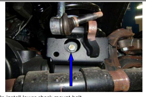
Re install lower shock mount bolt.