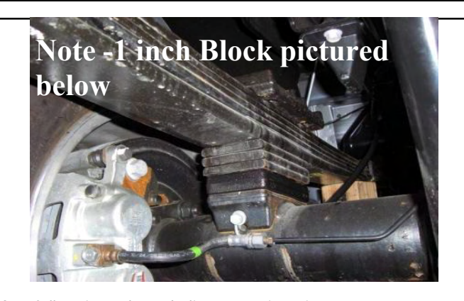
Carefully raise axle and align centering pin.