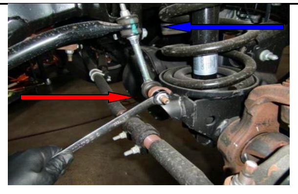
Disconnect Driver/ Pass Sway bar end links from axle