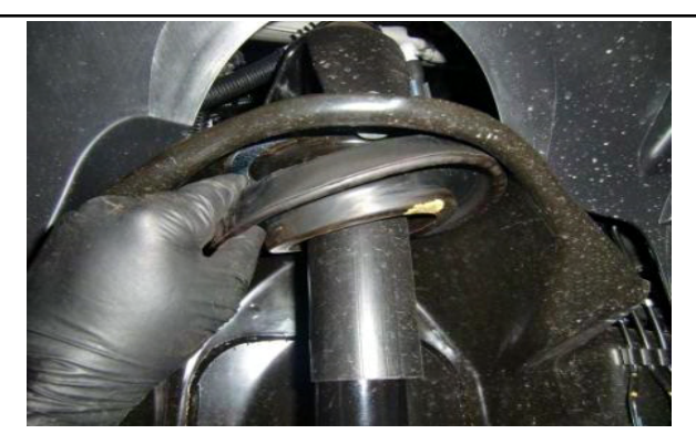
Remove Spring isolator if it did not come out with Coil Spring