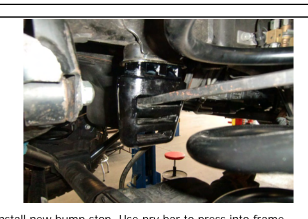
Install new bump stop. Use pry bar to press into frame.