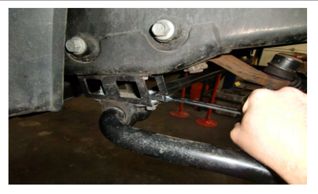
Tighten drop down bracket and sway bar.