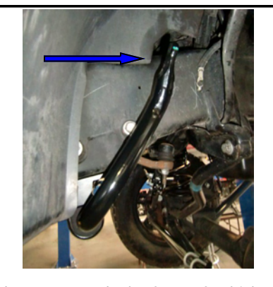
Rotate sway bar up towards the front of vehicle