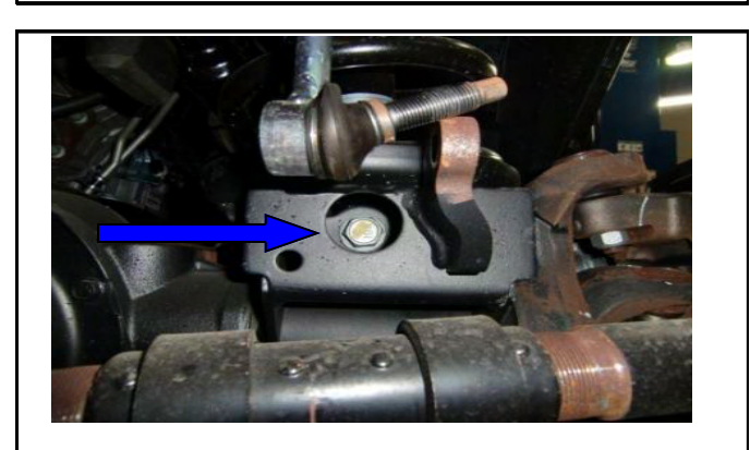
Disconnect Lower shock mount bolt under spring perch