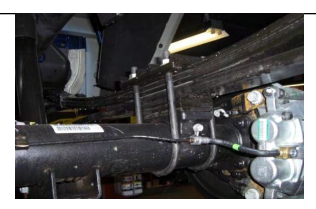
Support axle and disconnect lower shock mounting hardware.