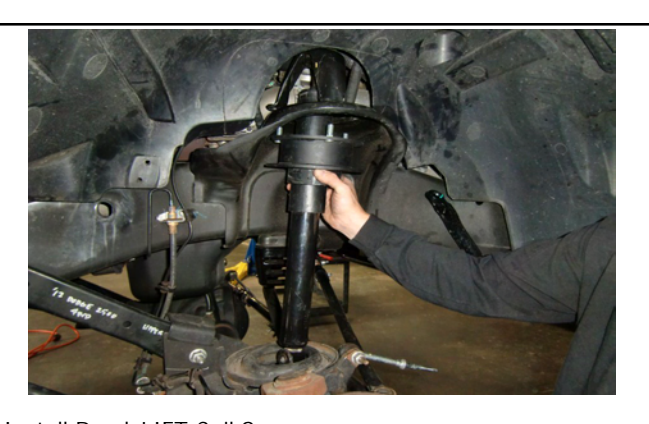
Install ReadyLIFT Coil Spacer