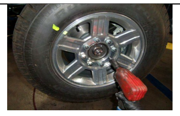
Raise front end of vehicle, support frame and remove wheels