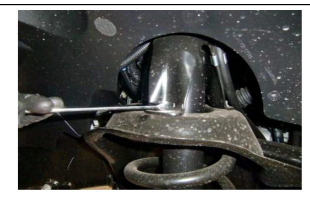
Loosen upper shock tower. Leave tower and nuts on.