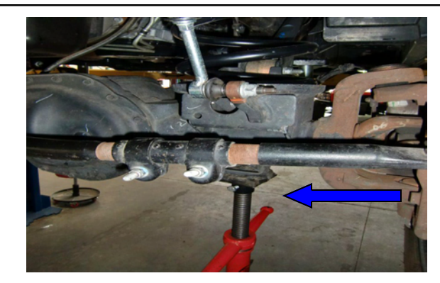
Raise axle to engage spring and shock mount.