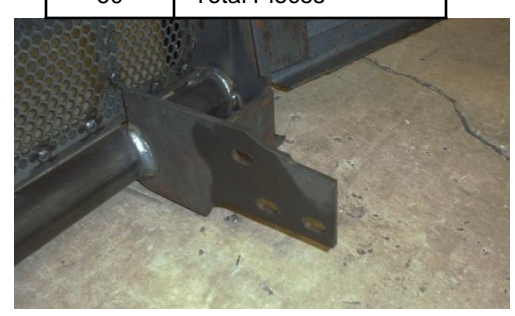
Front Bumper Replacement Bracket