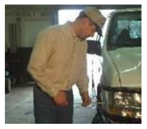
Step 4: Check alignment of front bumper replacement to truck and tighten all bolts.