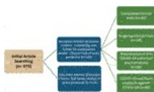
FIGURE 3. Flowchart for article search, screening and selection in literature

To summarize the findings regarding plant-based products and traditional medicines with completed and/or recruiting clinical trial status; a literature search was conducted using PubMed, Web of Science, Scopus, ScienceDirect, Wiley Online Library, Google Scholar, and CNKI Scholar databases. There was also a search for clinical trials on the ClinicalTrials.gov website ( https://www.clinicaltrials.gov/ ) because of its authenticity. The keywords used in the searches included “COVID-19,” “SARS-CoV-2,” “phytomedicines,” “bioactive compounds,” “Ayurved medicine,” “traditional Chinese medicine,” “herbal medicine,” “anti-COVID-19,” “plant-based medicine” and “clinical trials”. Only articles reporting completed and/or recruiting clinical studies and/or mechanisms of actions were included in the final review. There were 475 papers and clinical trials initially identified. After eliminating titles and abstracts related to clinical trials and/or mechanisms of action, 140 unique articles and clinical trials were identified that met the criteria and purpose of this review ( Figure 3 ).