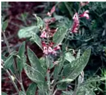
Sage ( Salvia officinalis )

In another, more recent study, rosmarinic acid was shown to dispose of excess activated T cells by inducing cellular suicide through an Lck-dependent apoptosis, a form of cellular suicide that is unique among plant phenols. Neither curcumin nor resveratrol, among other plant phenols, has been shown to do this. The rosmarinic acid-induced killing of excess immune cells is a longer process, taking at least 24 hours rather than the normal killing time of just two minutes. 14