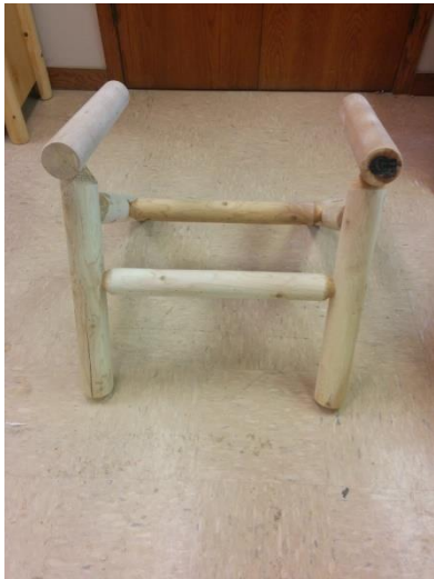
Step 5: Use wood glue and attach arms onto unit.