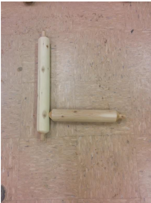
Step 6: Apply wood glue and insert small dowel into side dowels. Attach chair back top bar.