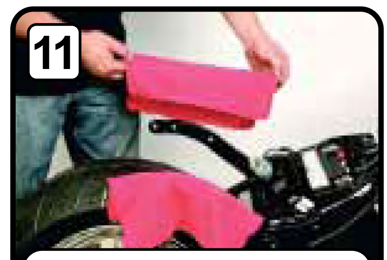
11. Cover the stock internal struts using a shop towel to prevent scratching your new paint.

8. Install the lower spacer to the swing arm, from where you just removed the stock clips.