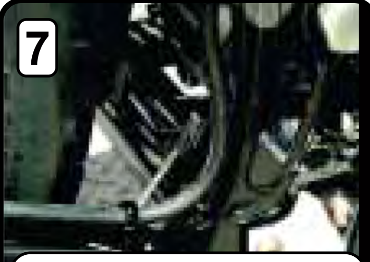
7. Remove the stock rock guard mounting clips from swing arm.