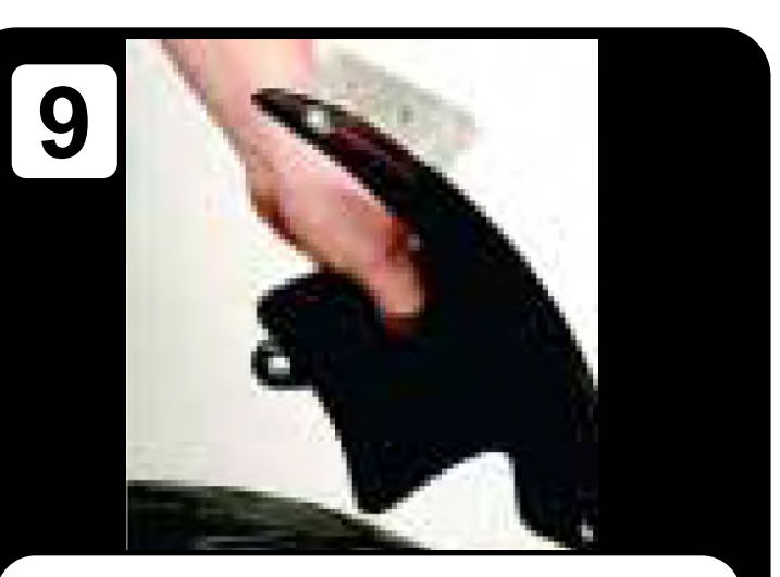
9. Attach the upper spacer to the new rock guard (slot facing down). Slide the new rock guard into place.