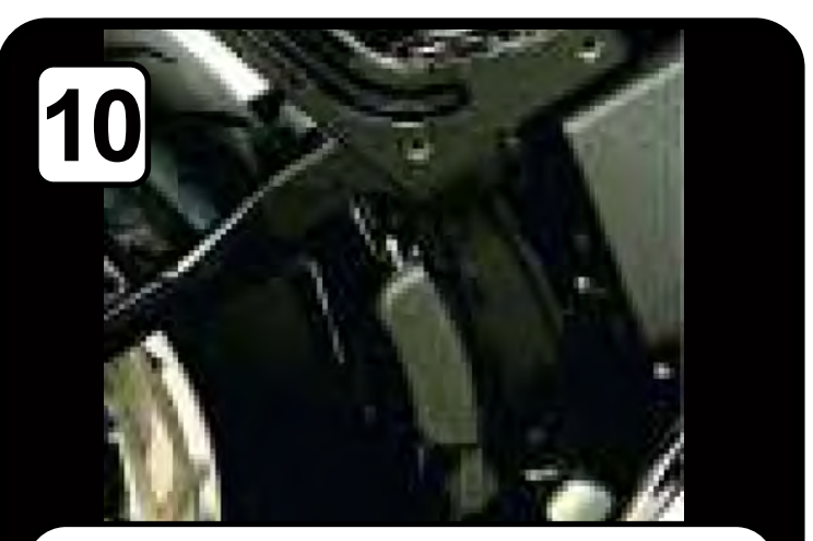
10. Slide the right rock guard down into place and tighten all hardware. (make sure to use Blue Locktite on hardware.)