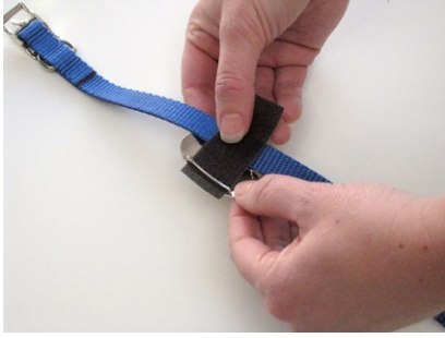
Lift the collar and velcro by pinching them together. Feed the top end of the velcro under the wire loop on the back of your collar tag. Just get it started; don't pull it all the way through.