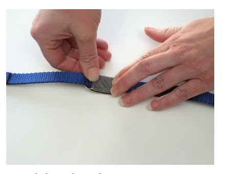
... and then the other on top. 6