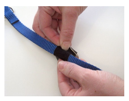
Now, while still keeping the collar against the velcro, feed the bottom end of the velcro under the bottom wire loop. *This is the hard part!