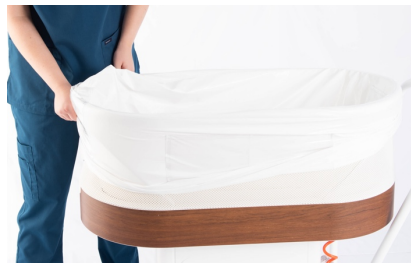
Covers on Outer Perimeter