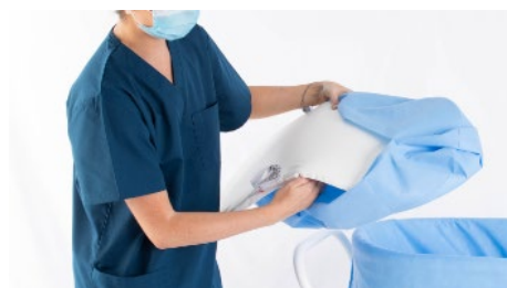
Mattress with Cover