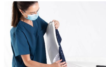
Sealed Mattress with Fitted Sheet