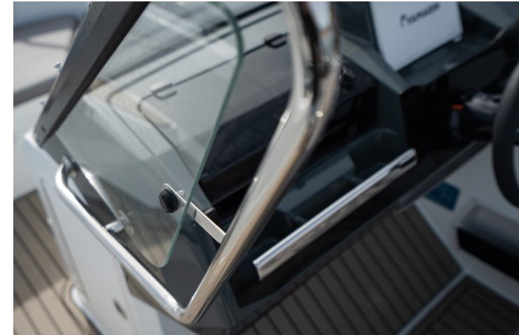
Robust rail around the windshield