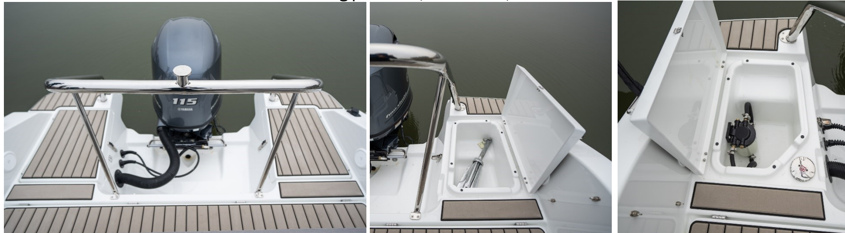
Bathing platforms, anchor box, fuel fill and filter in aft