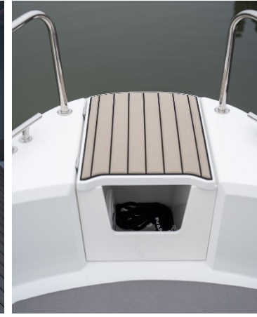
Anchor box in bow