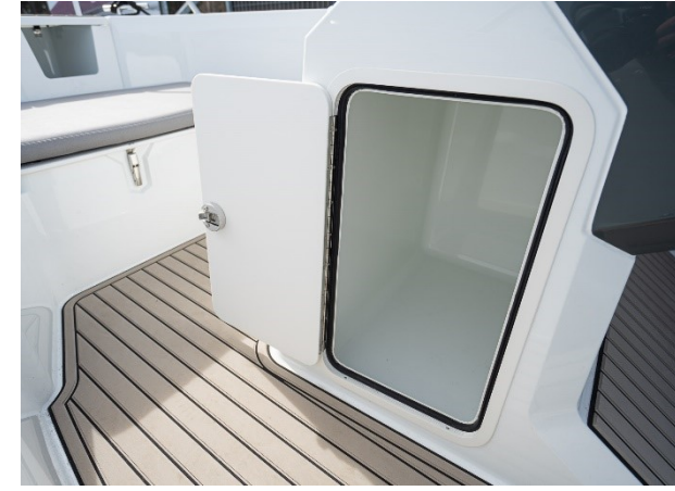
Big stowage in console