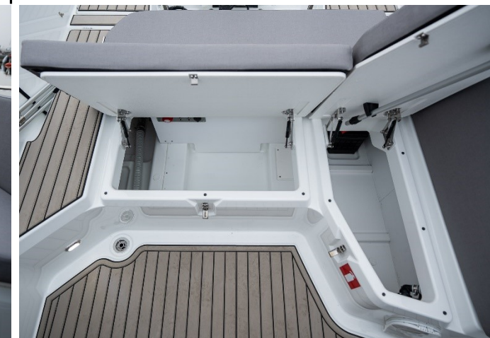
Locking mechanics of backrest