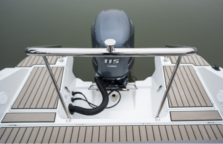
Bathingplattform, anchor boxes, fuel fill and filter